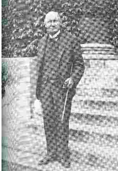
1936 at Harvard (age 75)